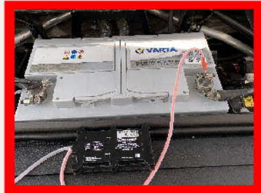
STEP 2 - CONNECT THE TERMINALS