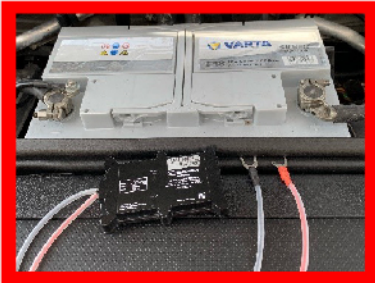
STEP 1 - LOCATE THE BATTERY

Both lights need to be flashing for the device to operate. Download the TruTrak App from the App/Play store. Your username is your email, select forgotten password to set up the account access. You can do this from www.westfieldtrutrak.com on a PC or Mac.