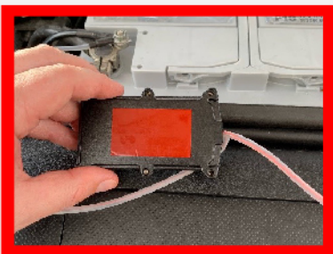
STEP 3 - PEEL BACK THE ADHESIVE PAD